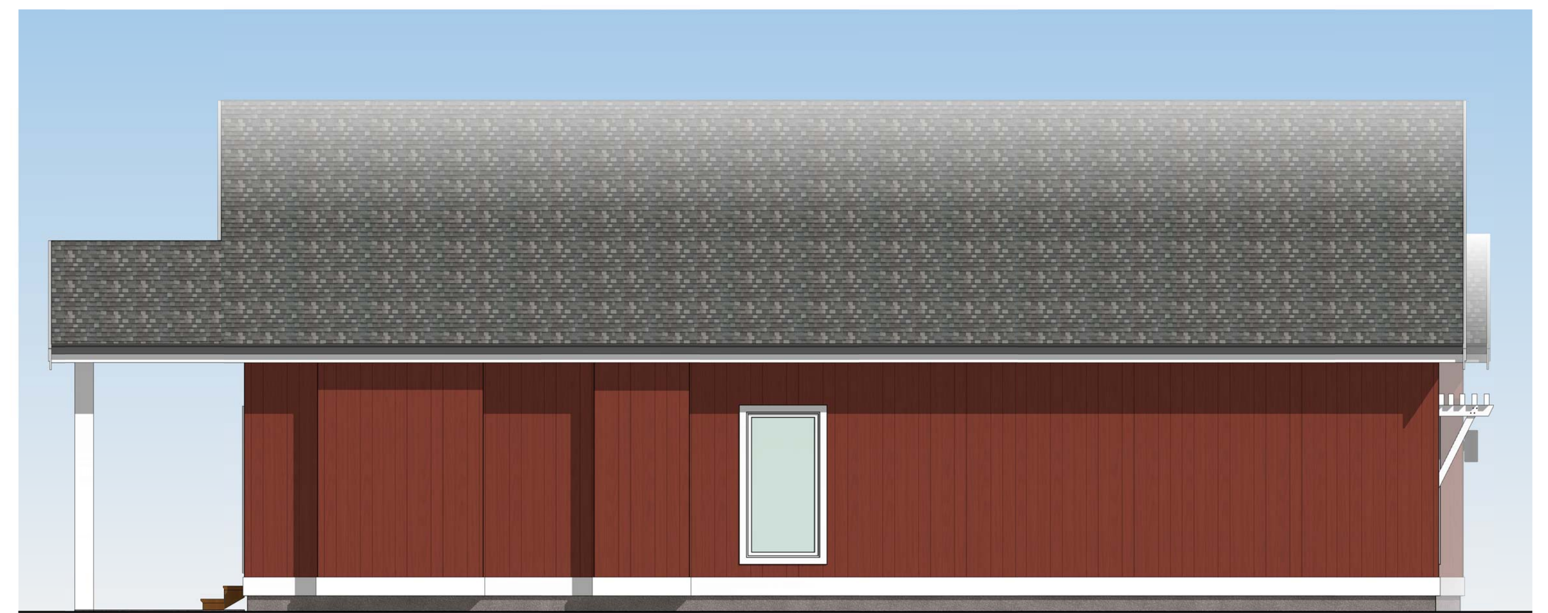
REAR 1/4" = 1'-0"