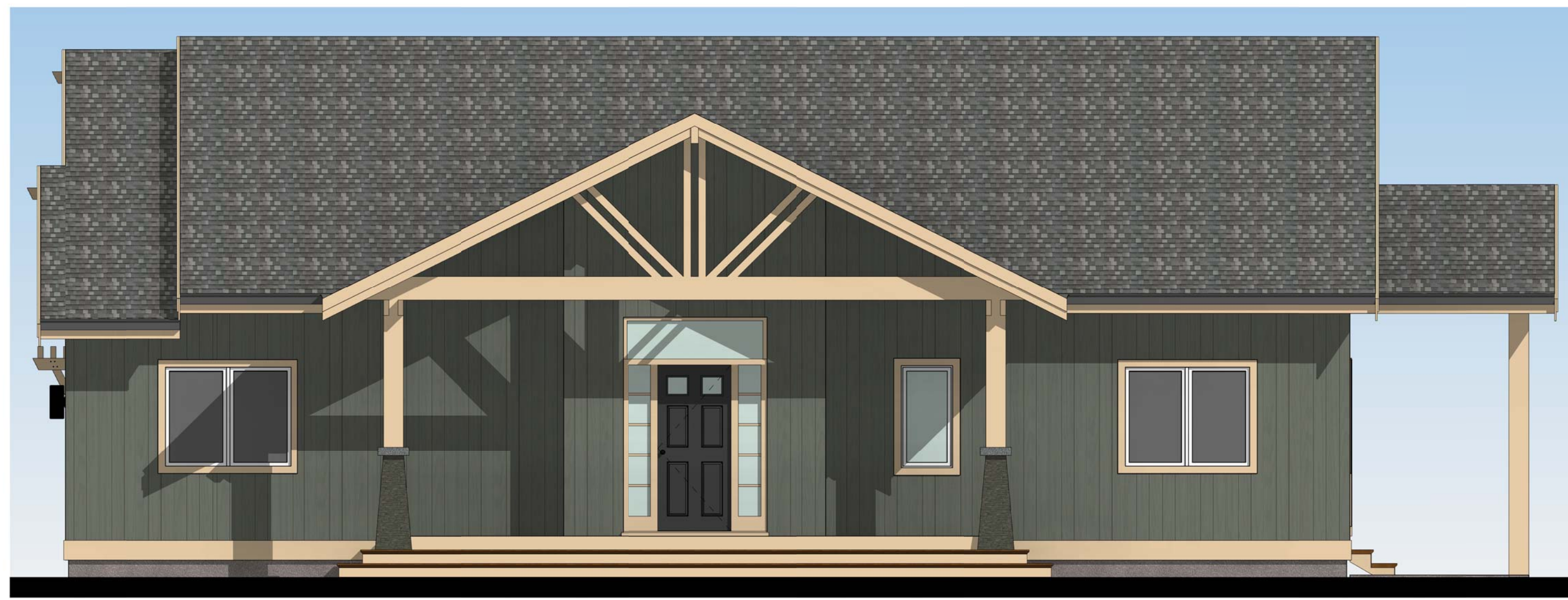
FRONT 1/4" = 1'-0"