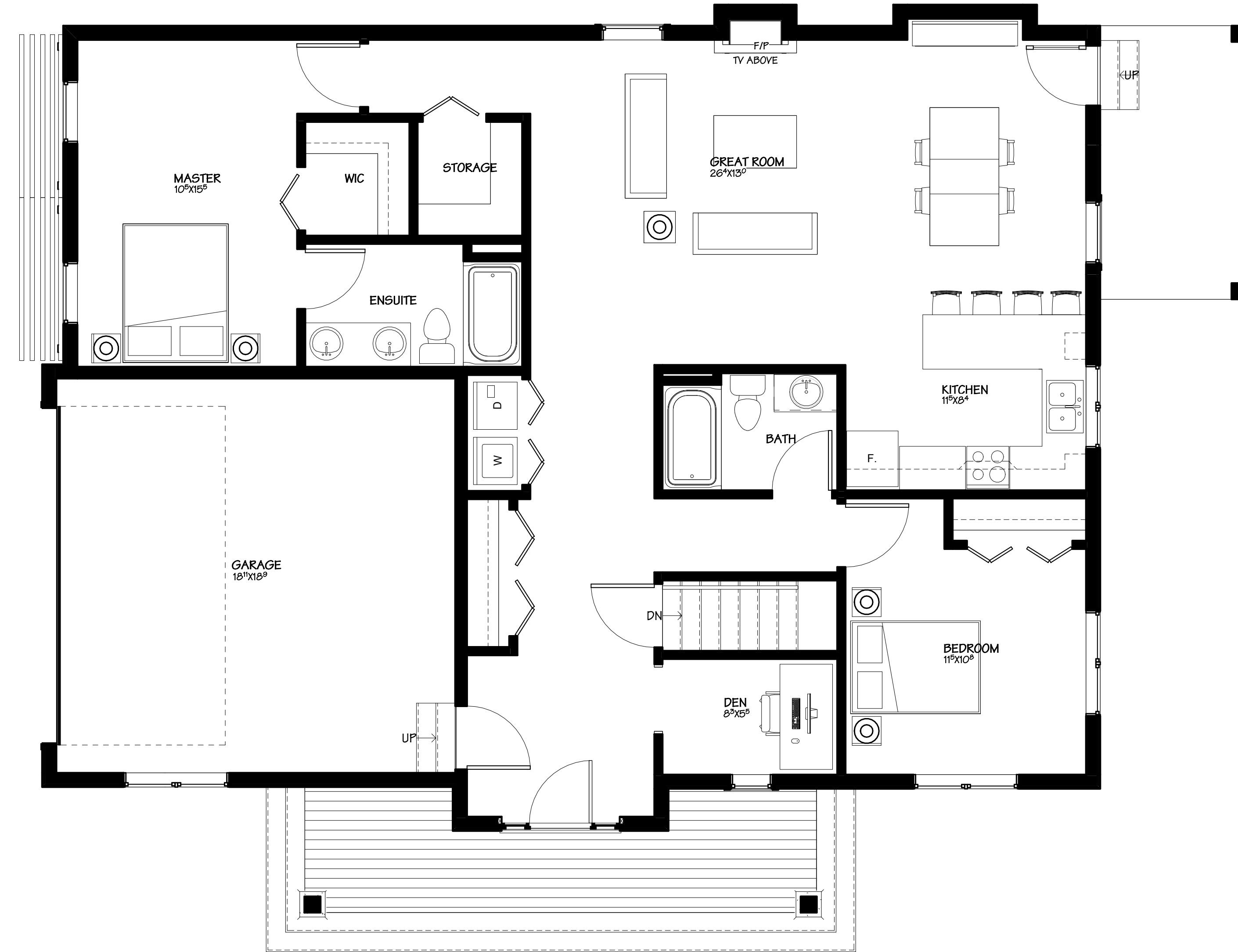
MAIN 1/4" = 1'-0"