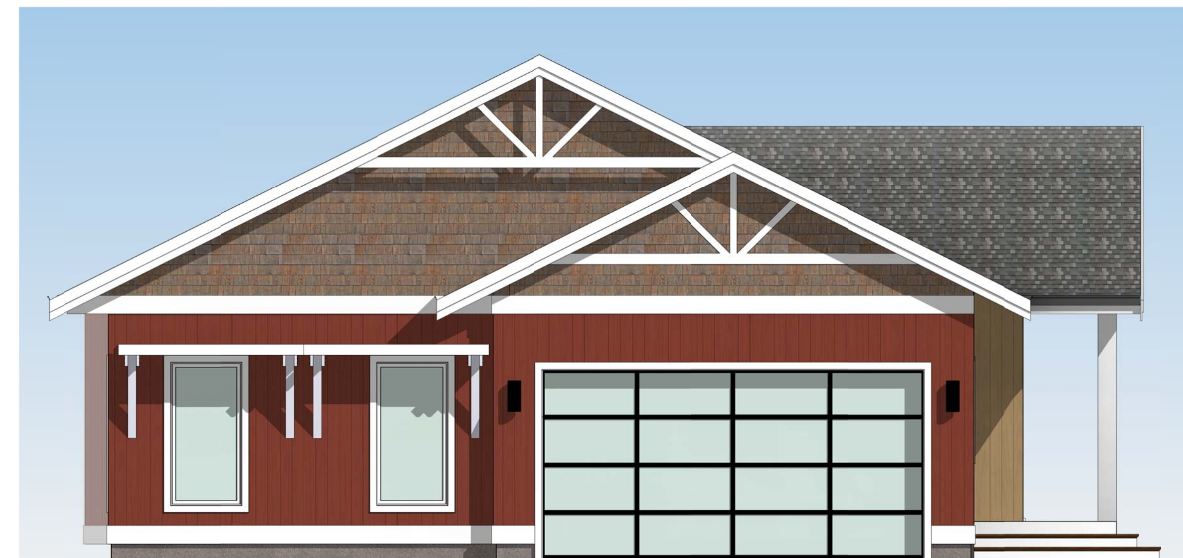
SIDE 1 1/4" = 1'-0"