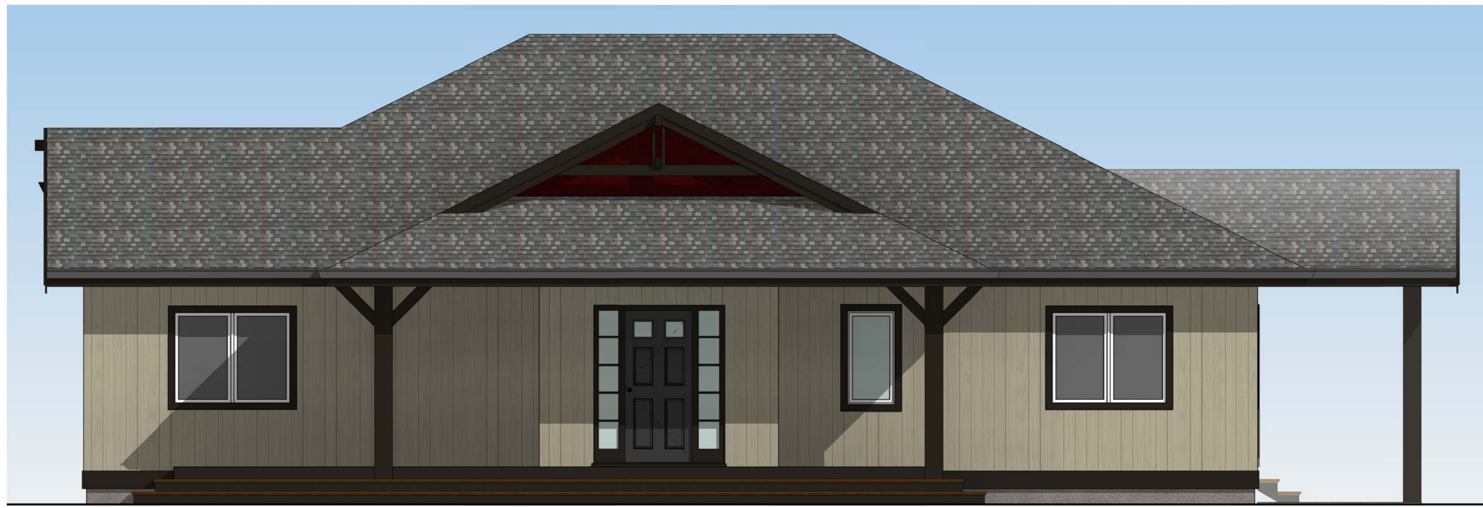
FRONT 1/4" = 1'-0"