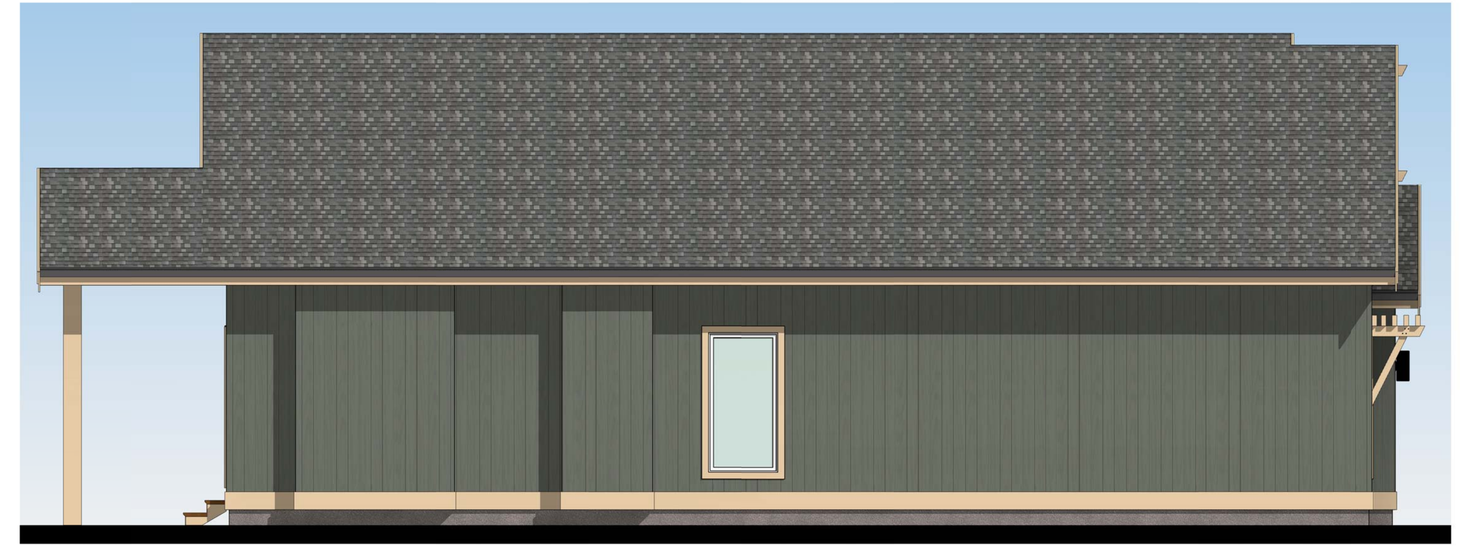
REAR 1/4" = 1'-0"