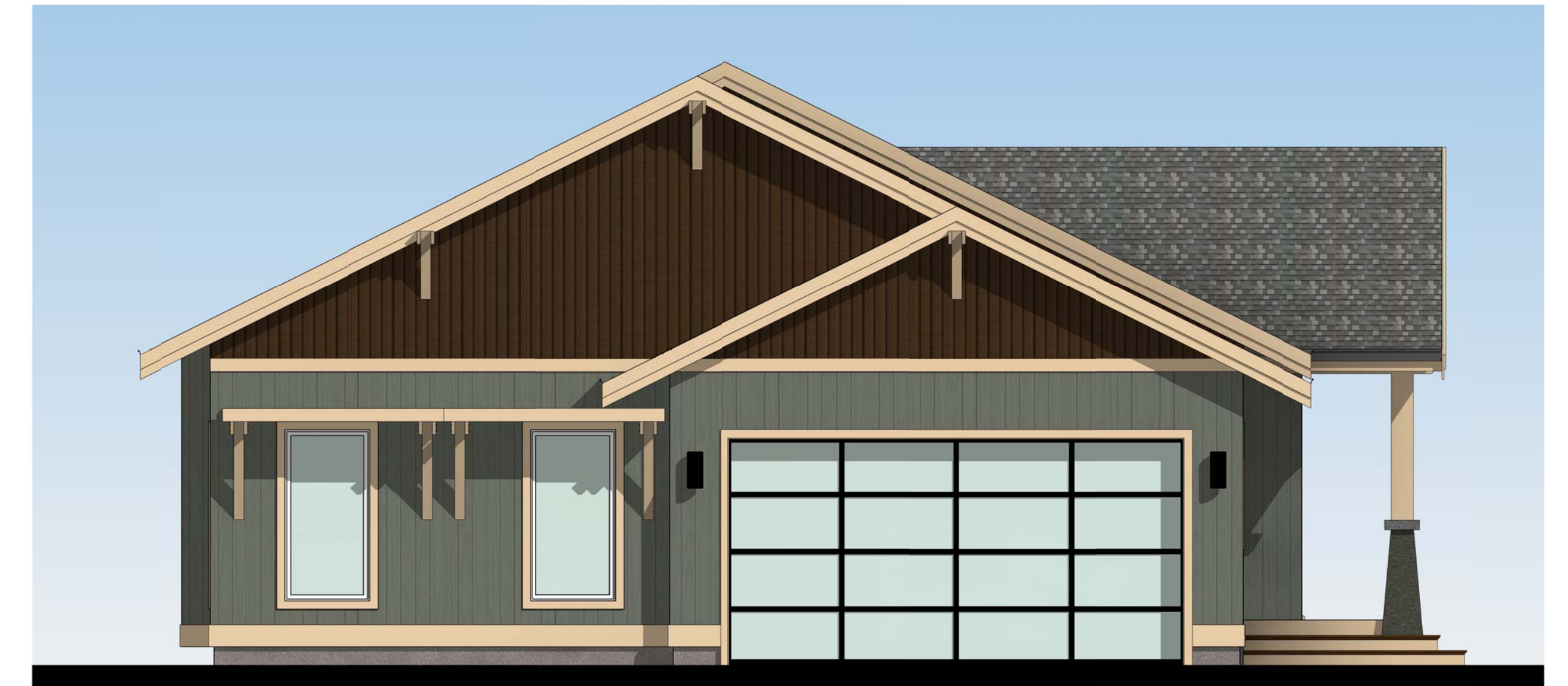
SIDE 1 1/4" = 1'-0"