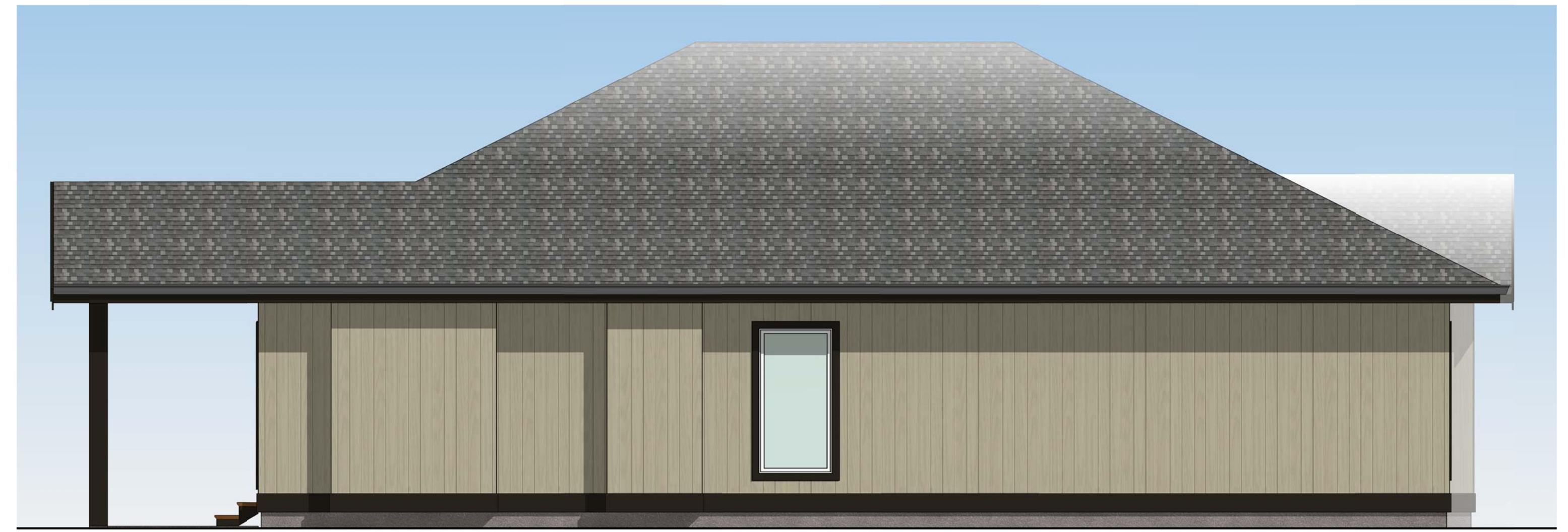
REAR 1/4" = 1'-0"