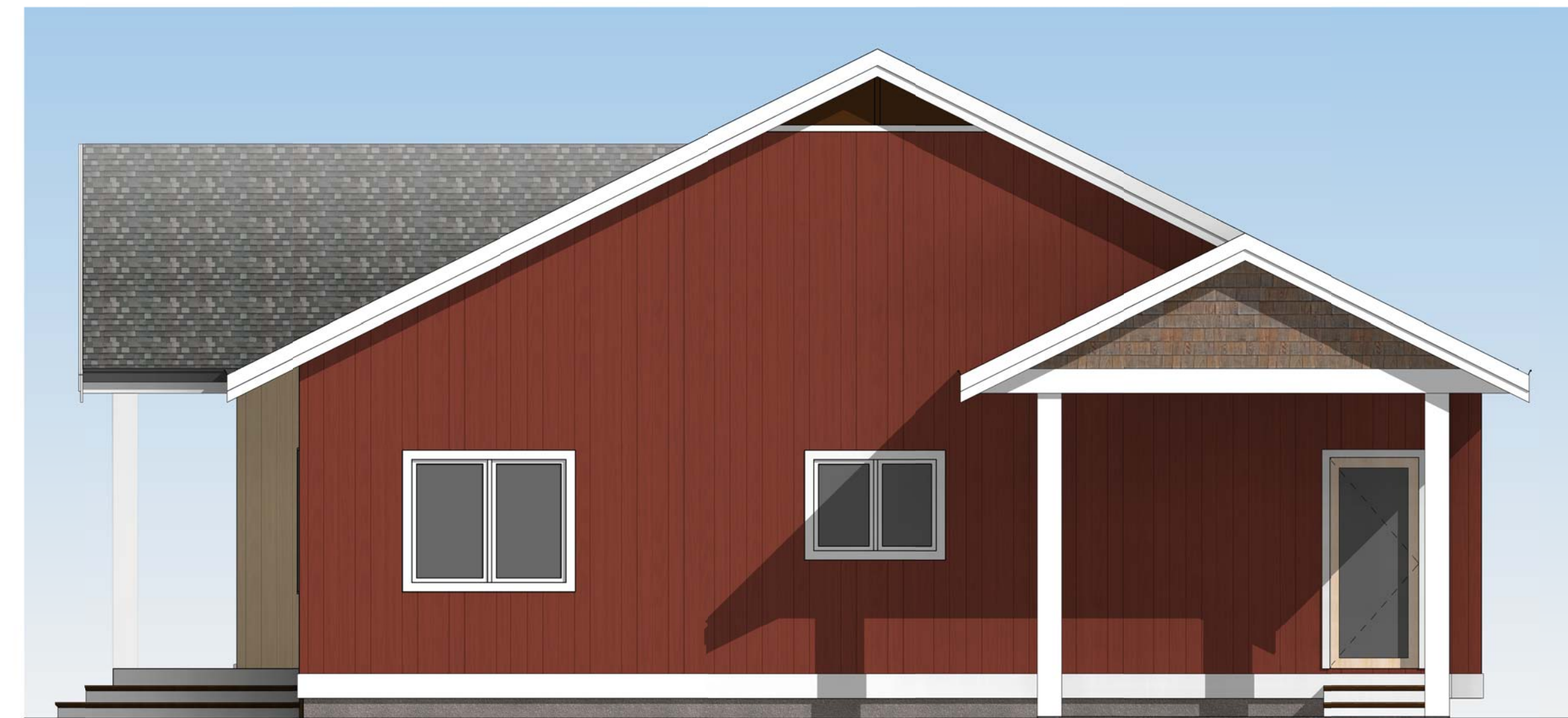
SIDE 2 1/4" = 1'-0"