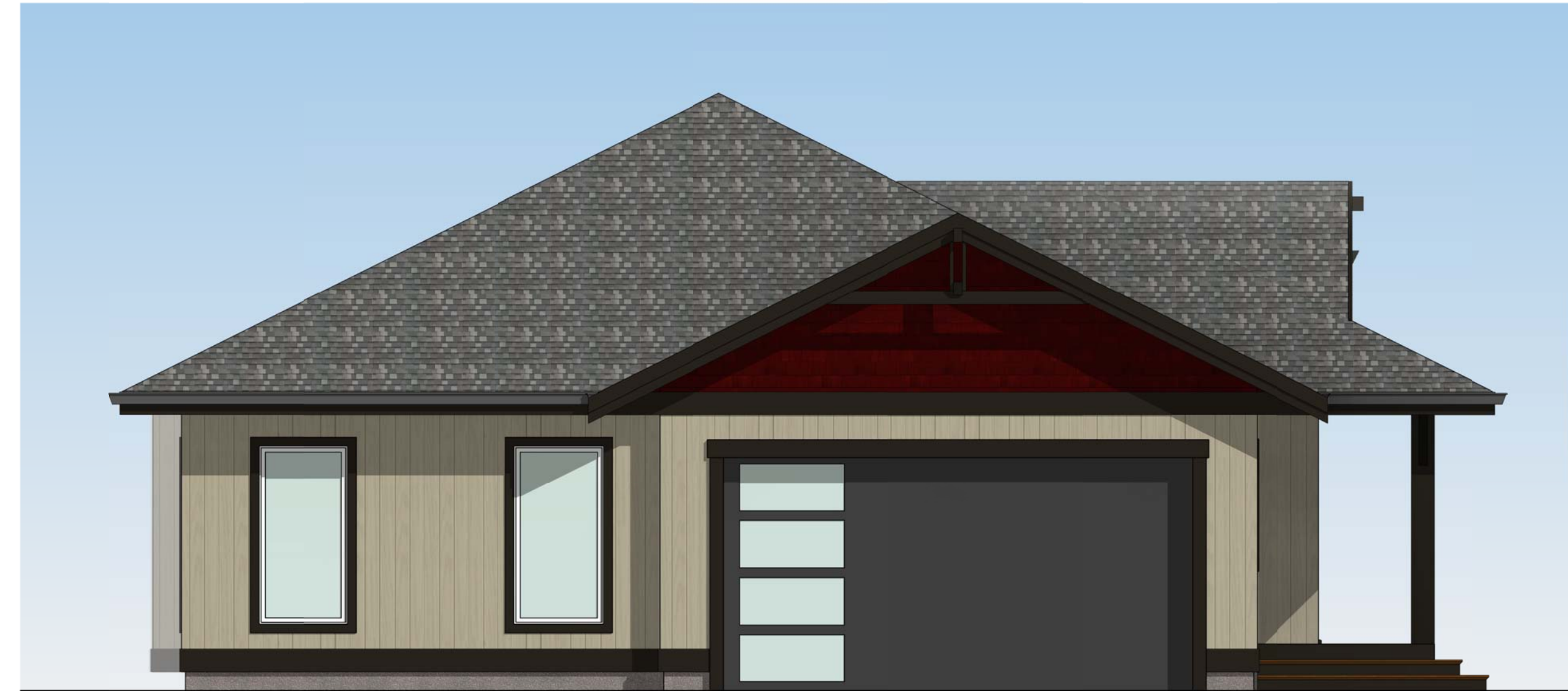
SIDE 1 1/4" = 1'-0"