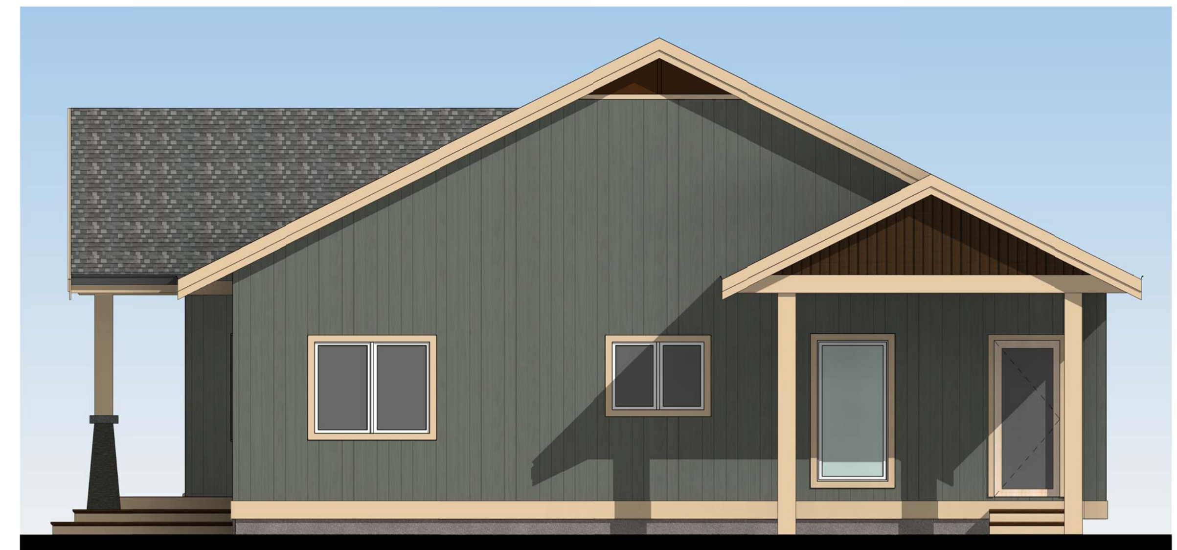
SIDE 2 1/4" = 1'-0"