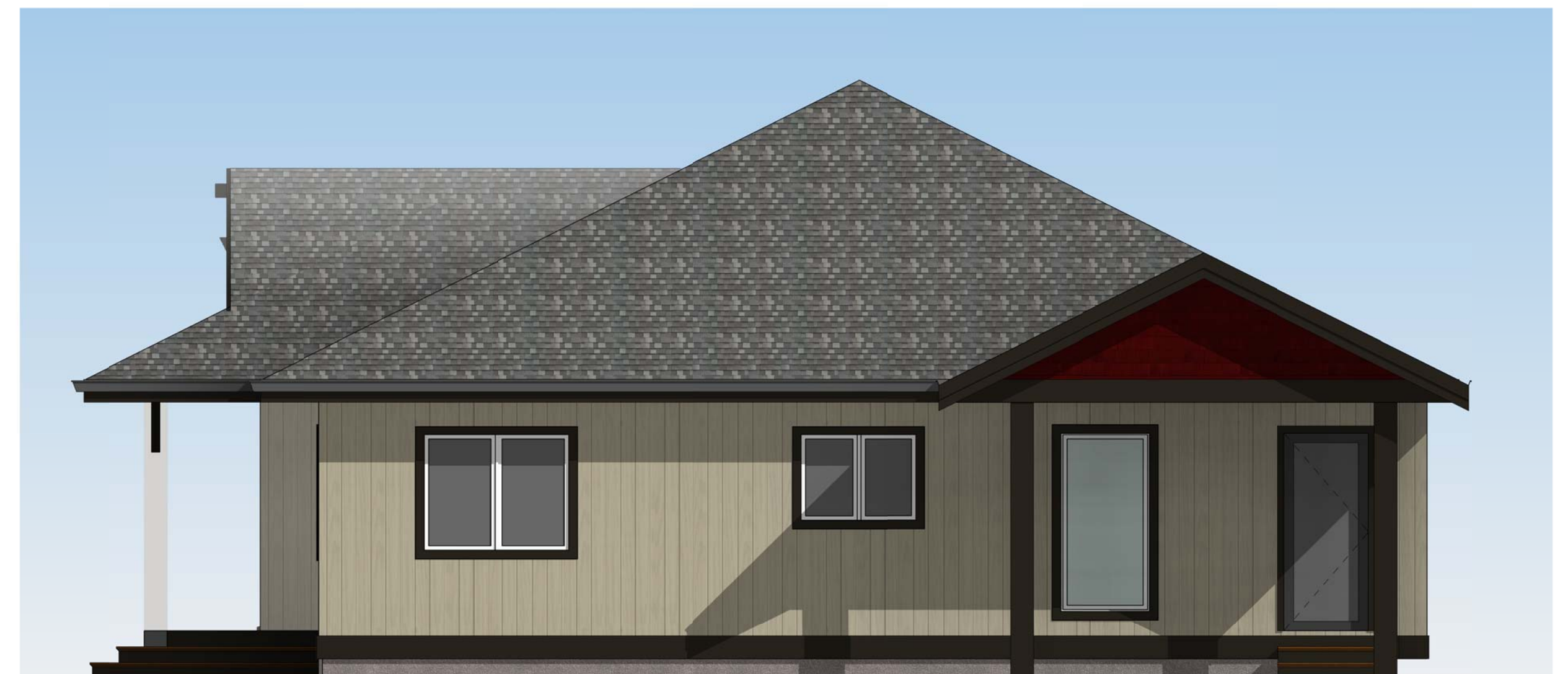
SIDE 2 1/4" = 1'-0"