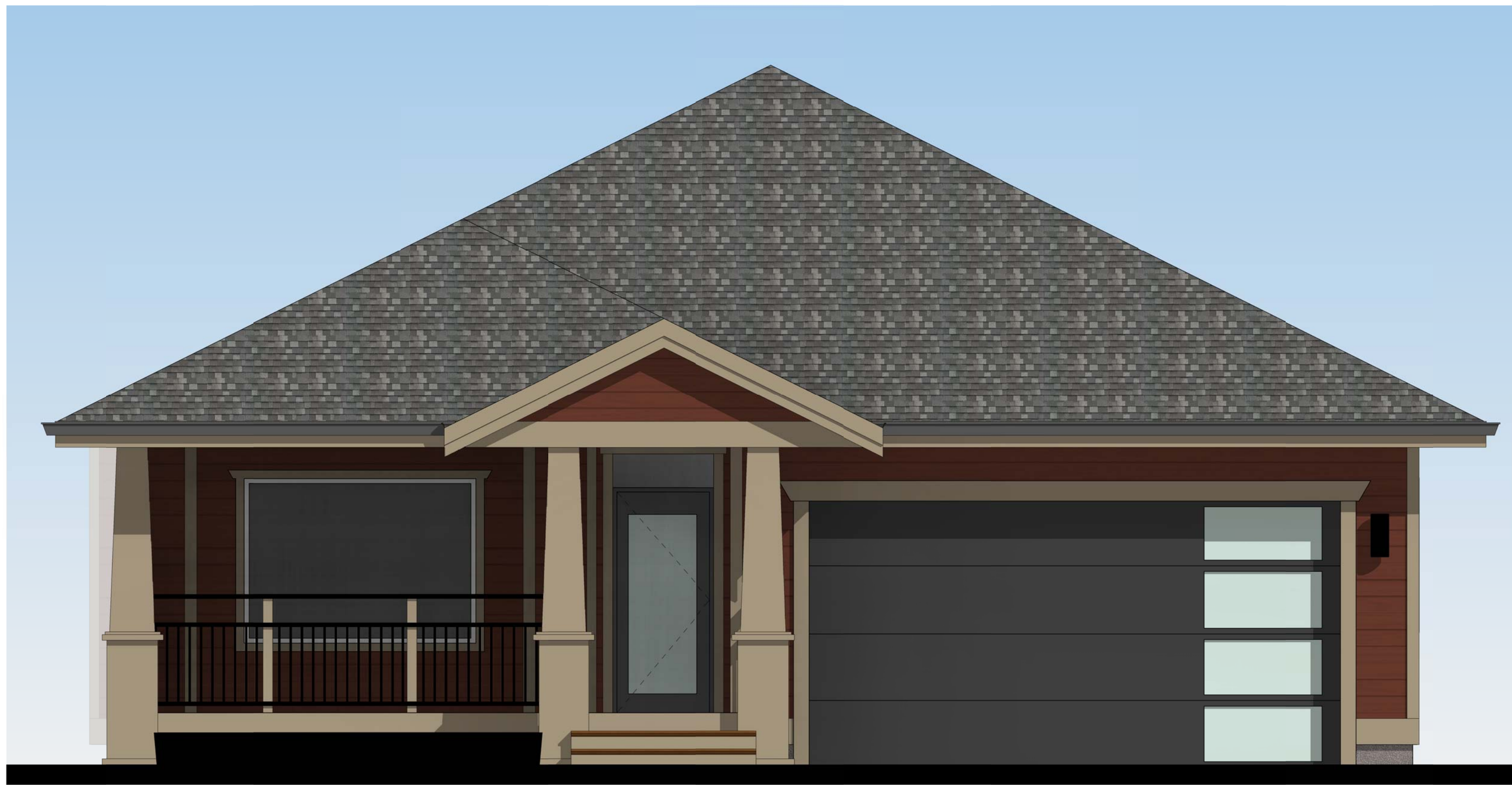
FRONT 3/8" = 1'-0"