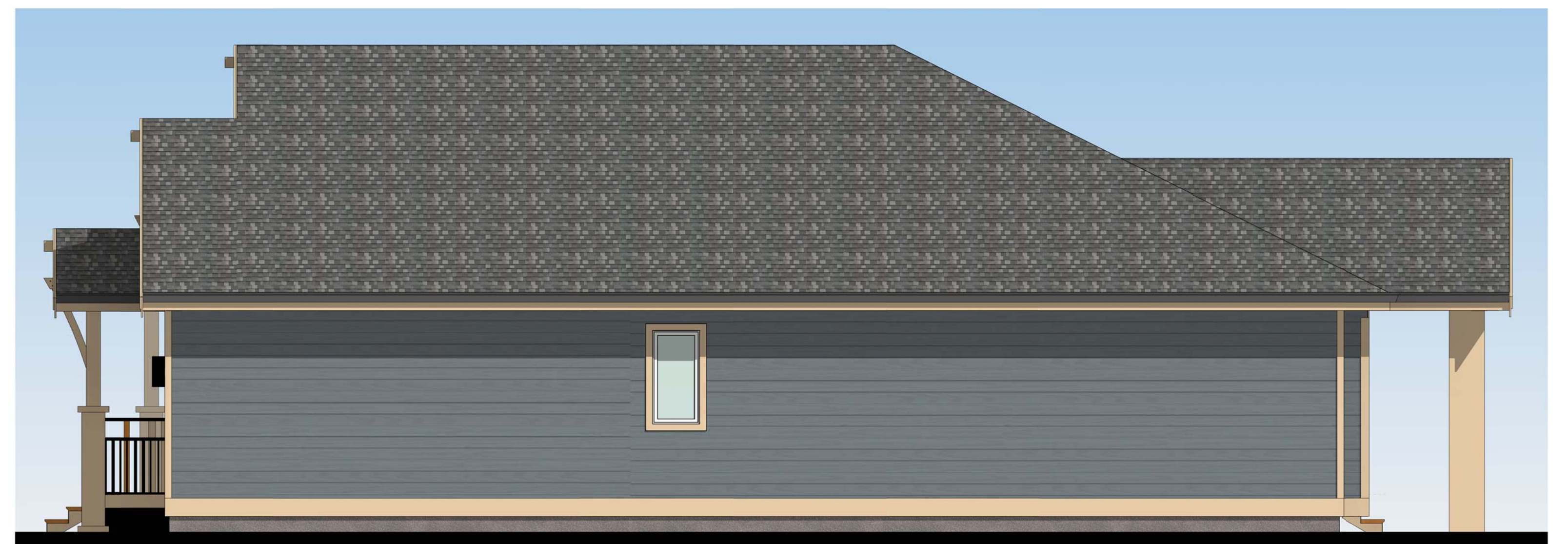
SIDE 2 1/4" = 1'-0"