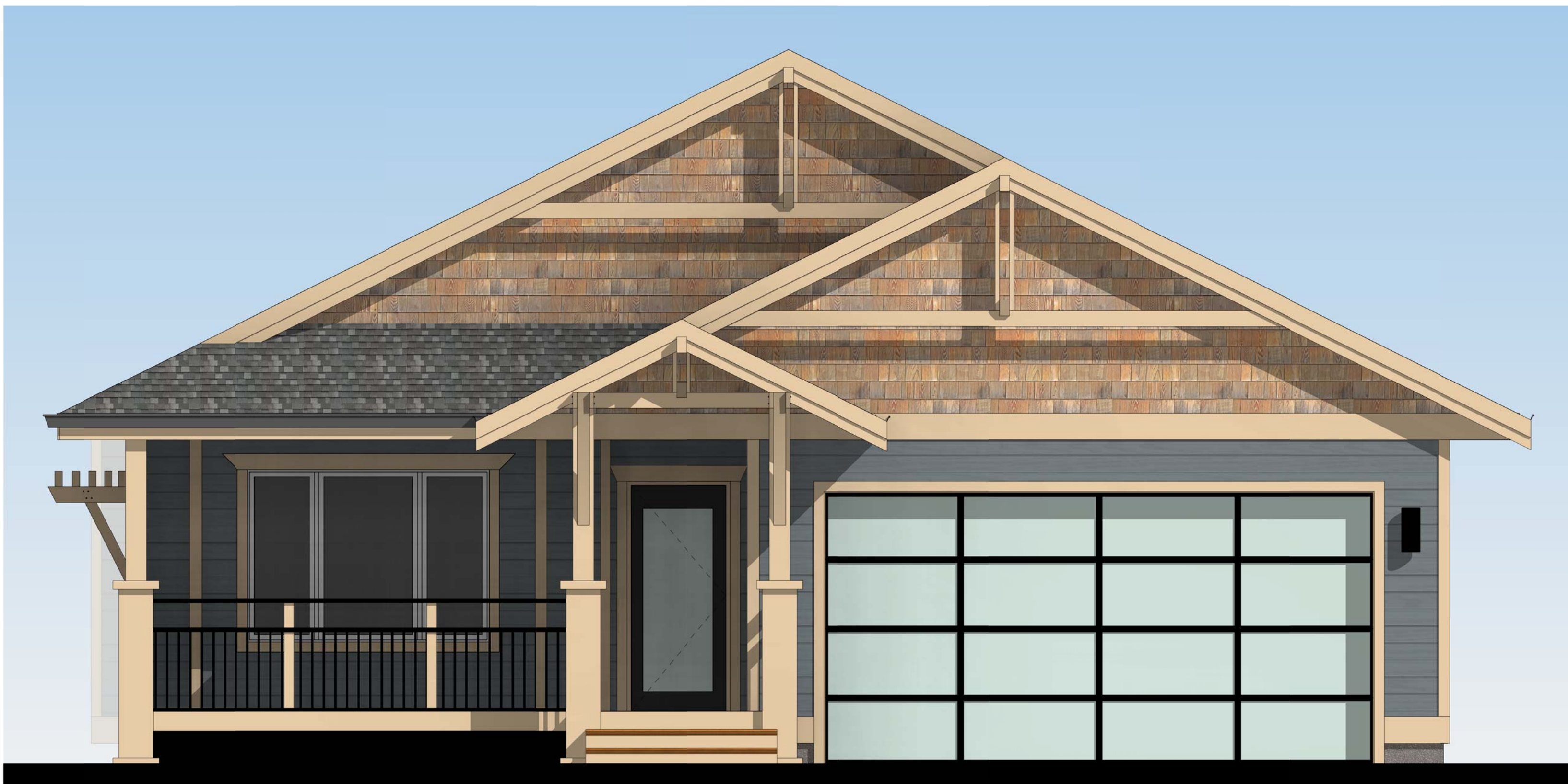
FRONT 3/8" = 1'-0"