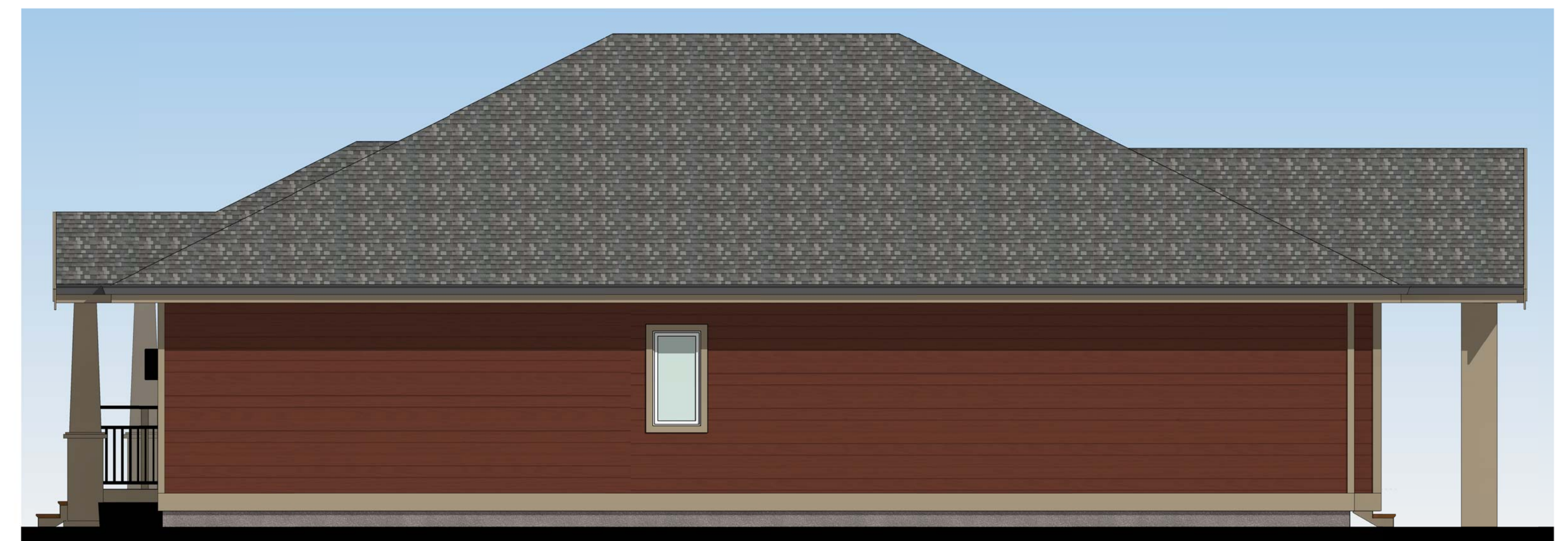
SIDE 2 1/4" = 1'-0"