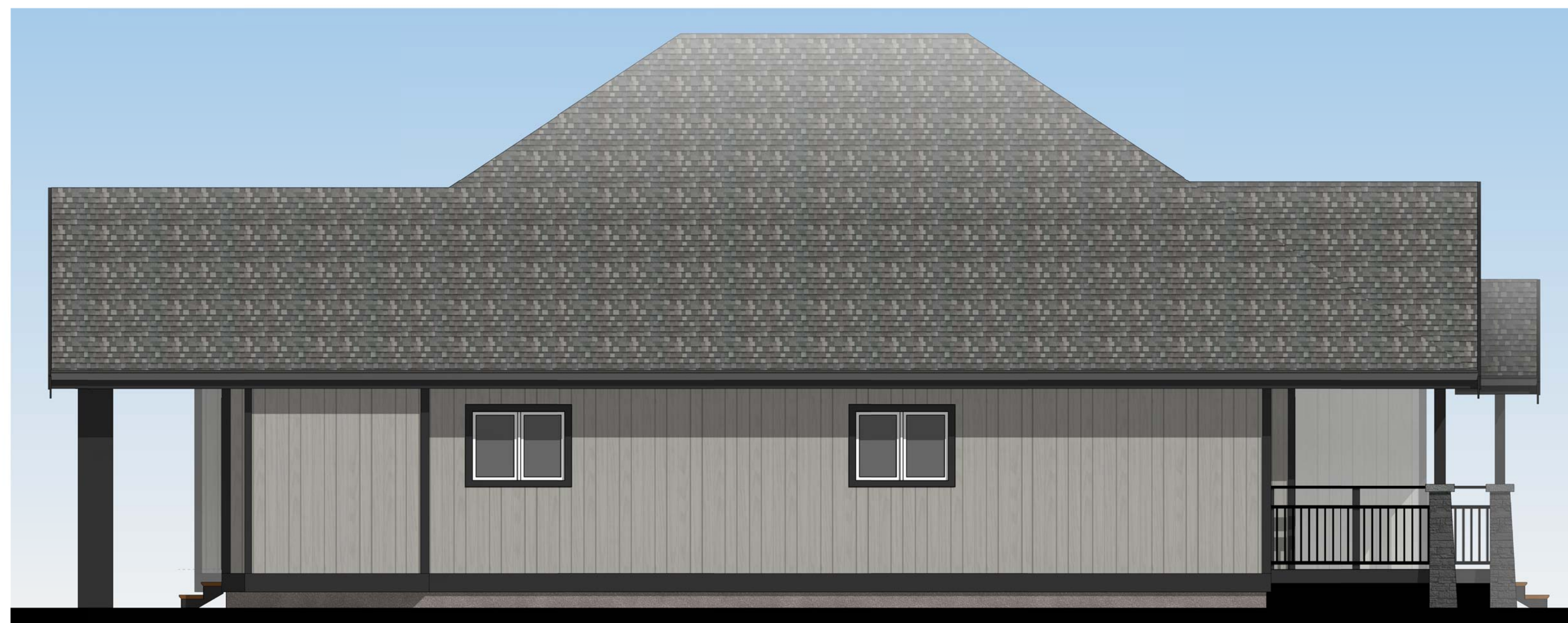
SIDE 1 1/4" = 1'-0"