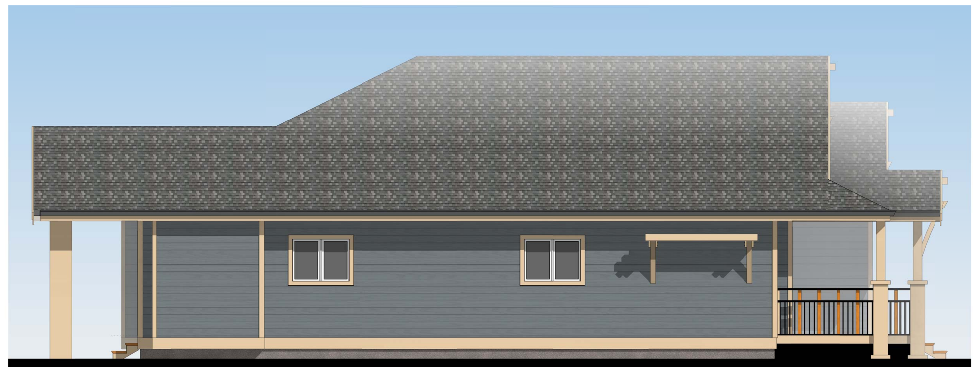
SIDE 1 1/4" = 1'-0"