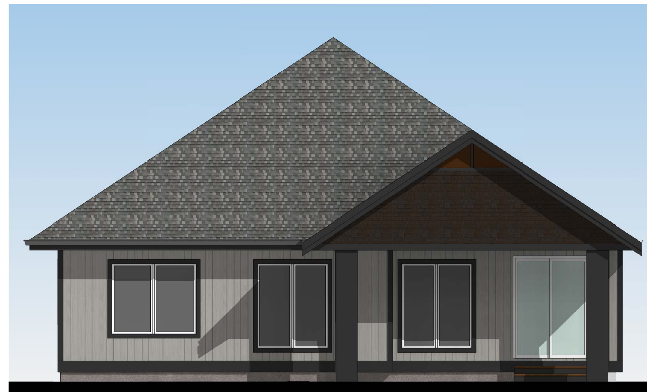
REAR 1/4" = 1'-0"