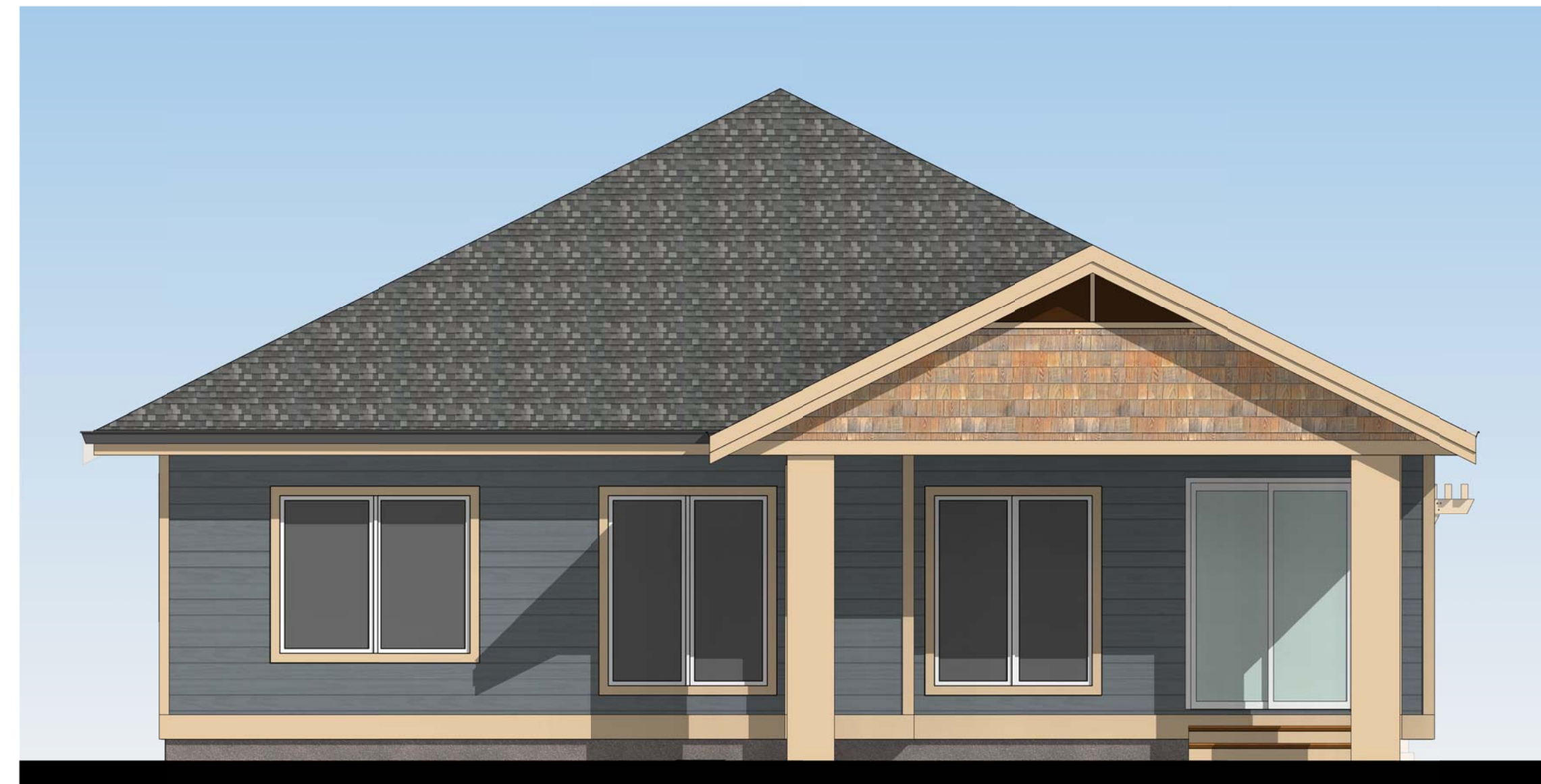
REAR 1/4" = 1'-0"