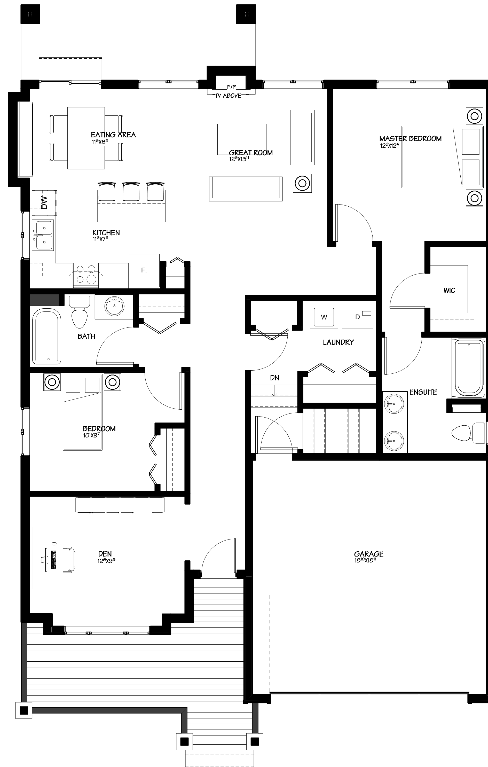
MAIN 1/4" = 1'-0"