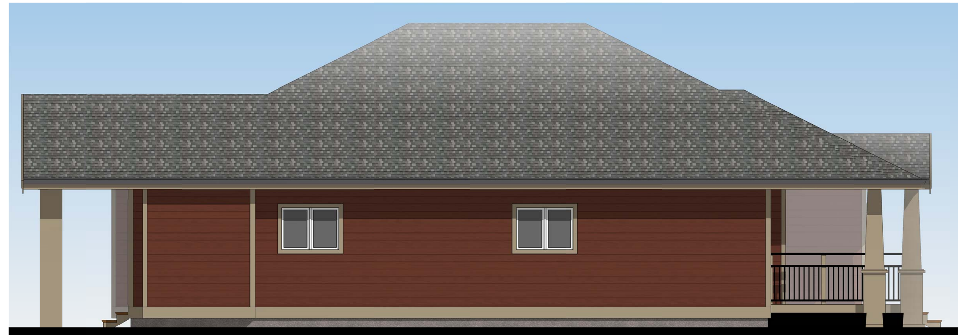
SIDE 1 1/4" = 1'-0"