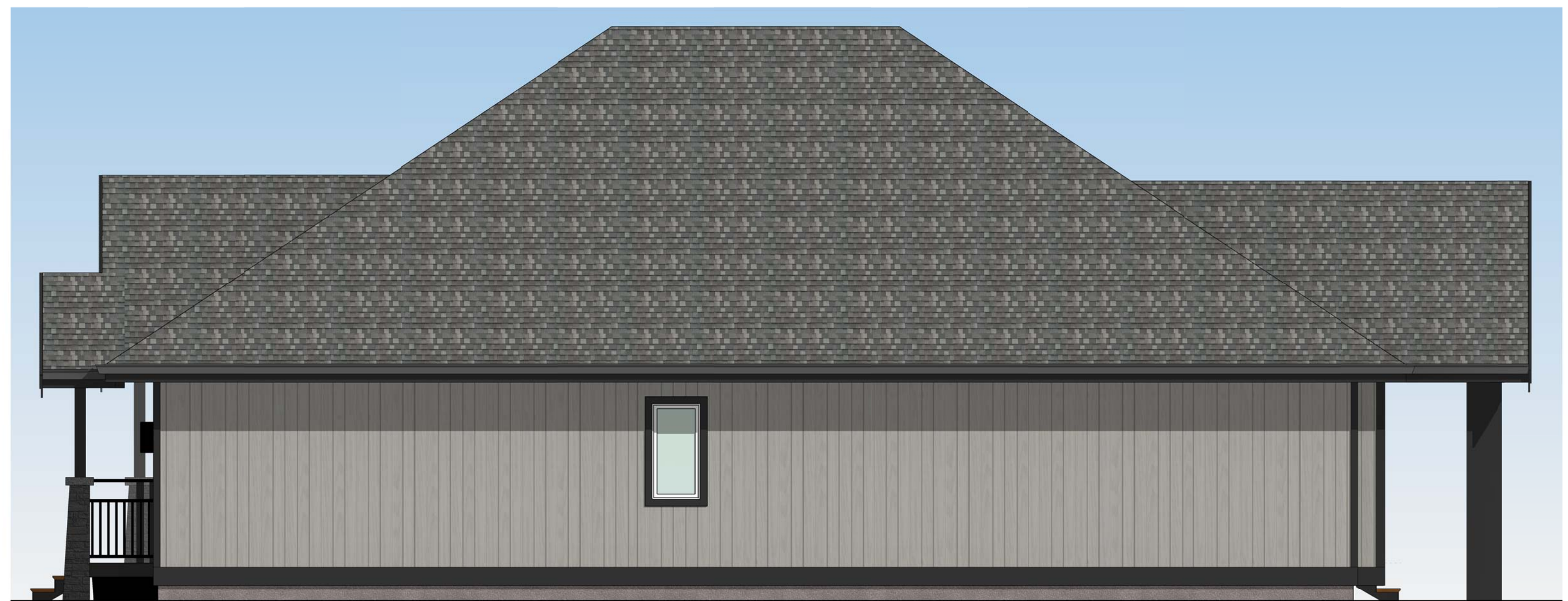
SIDE 2 1/4" = 1'-0"